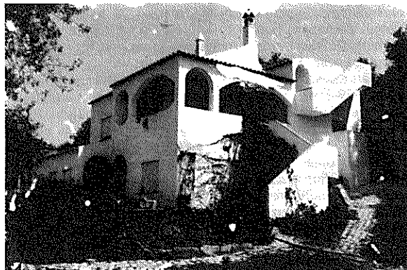
Vale do Lobo. Villa with three bedrooms, two bathrooms, living room, dining room, open fireplace. Fully equipped kitchen. Carport. 1,000 sq metres mature garden. 95,000 pounds.