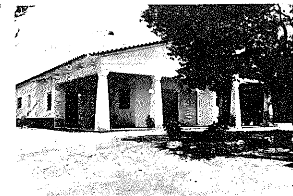
Almansil. Pleasant Algarve cottage suitable for conversion. Eight good size rooms. 2,000 sq metres of land. Mains electricity. Price: 12,000 pounds.